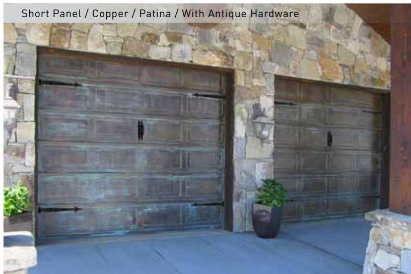
Short Panel / Copper / Patina / With Antique Hardware