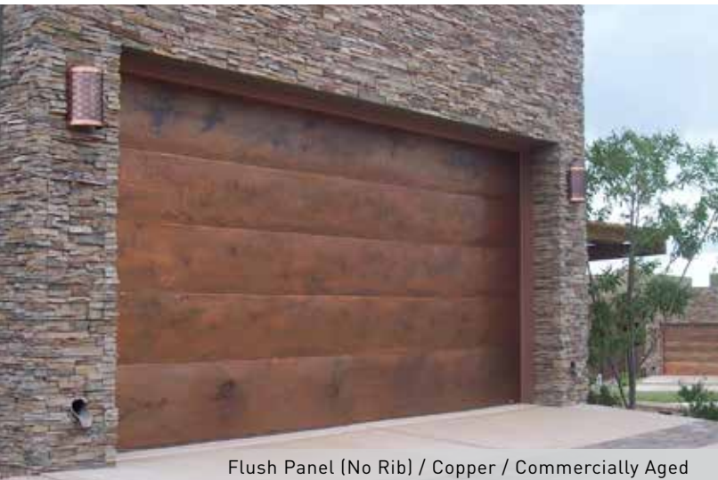
Flush Panel (No Rib) / Copper / Commercially Aged