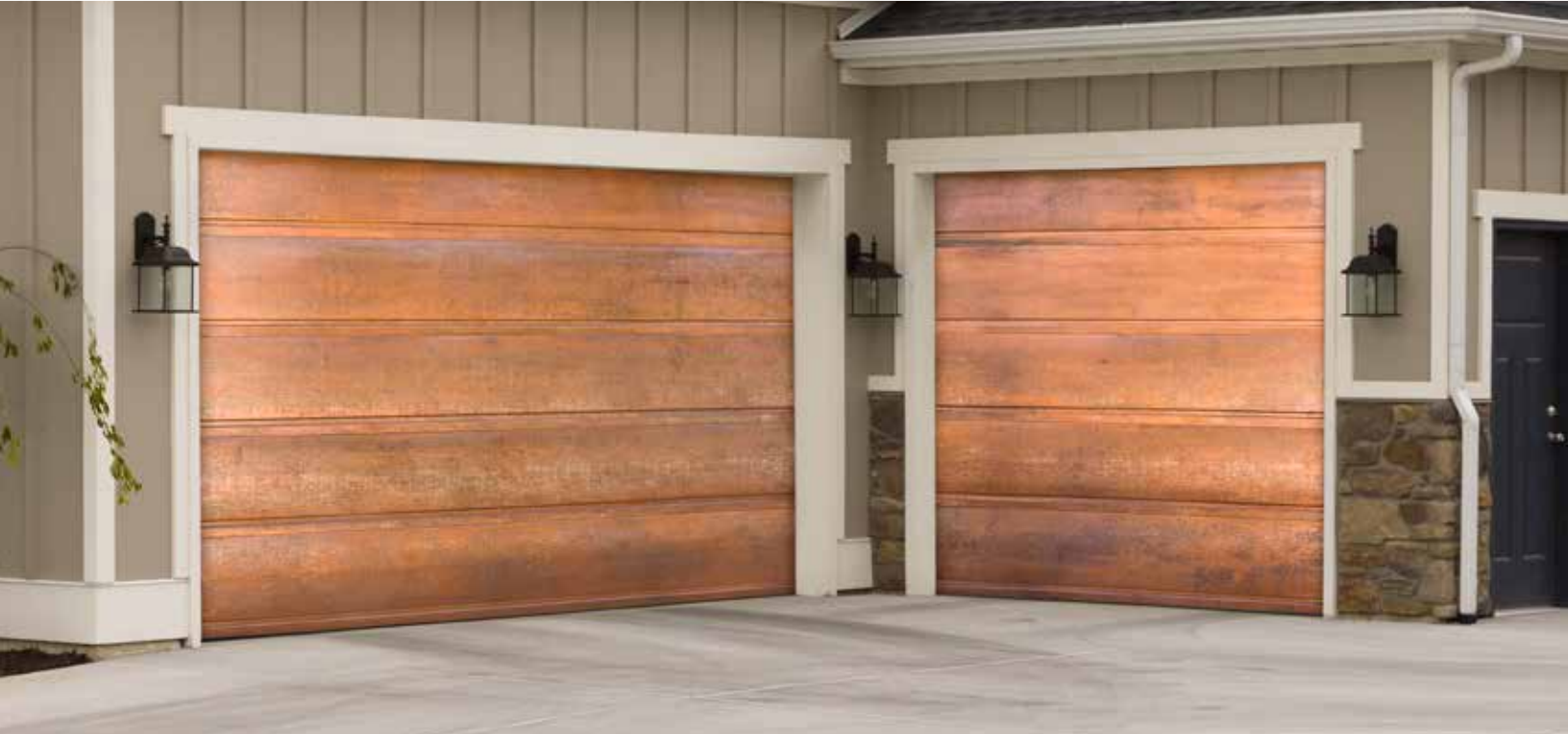
Flush Panel (With Rib) / Copper