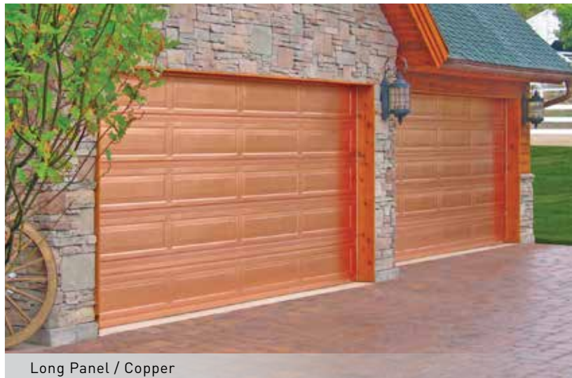
Long Panel / Copper