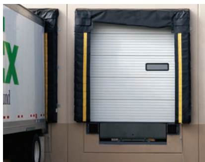
Vision Lites allow for visibility while maintaining security