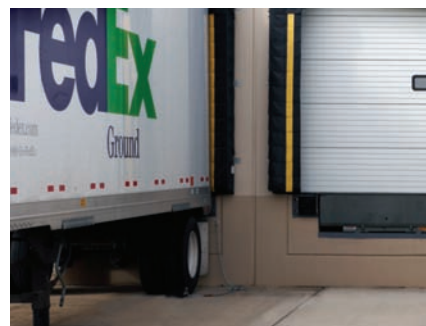
Aluminum full view sections allow for maximum natural light and visibility