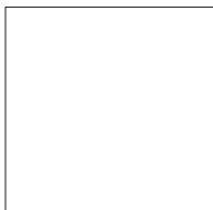
White Smooth Finish