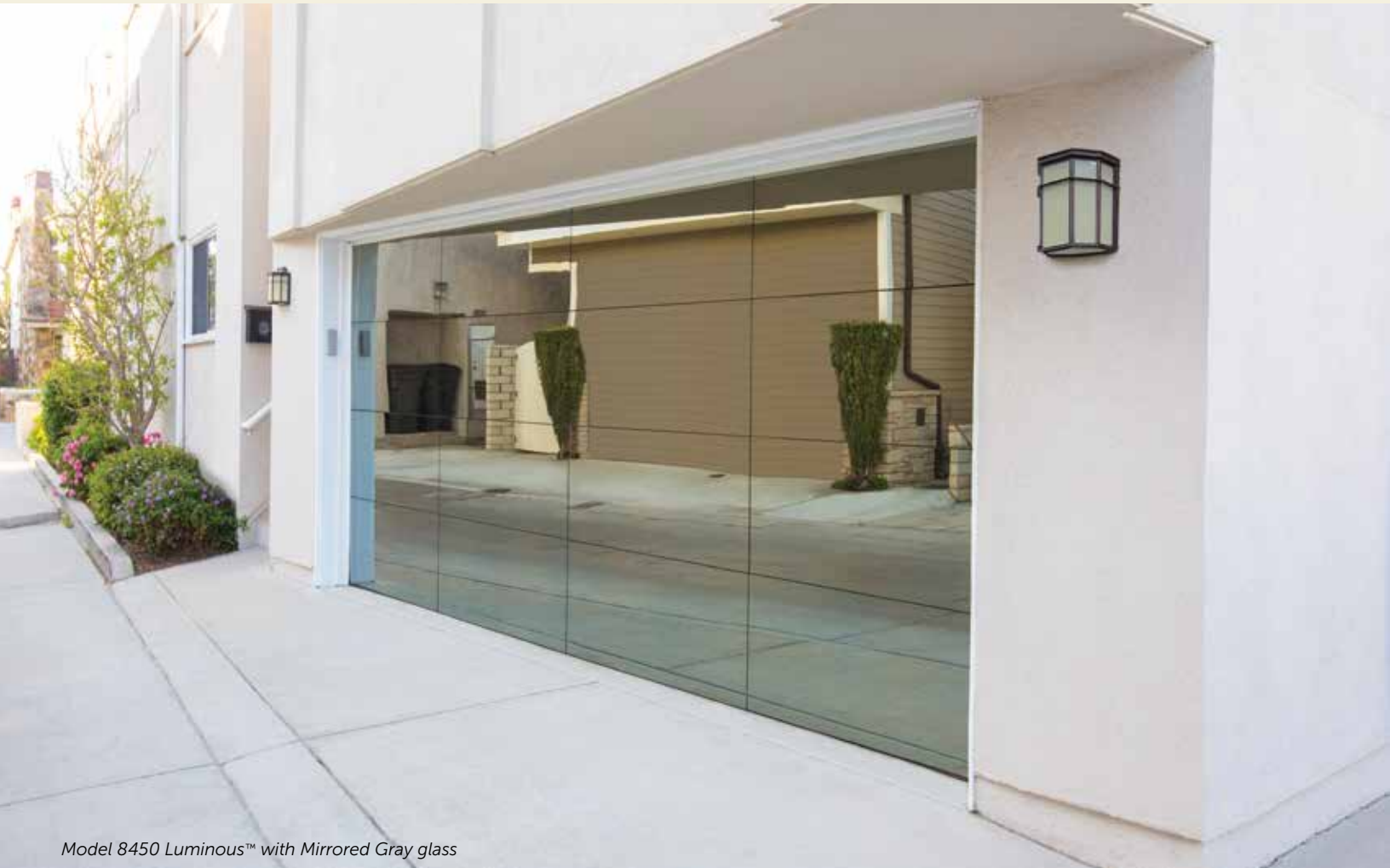
Model 8450 Luminous™ with Mirrored Gray glass

Glass panels are mounted on top of an aluminum structure for an ultra-modern, frameless look on an easy-to-maintain door.