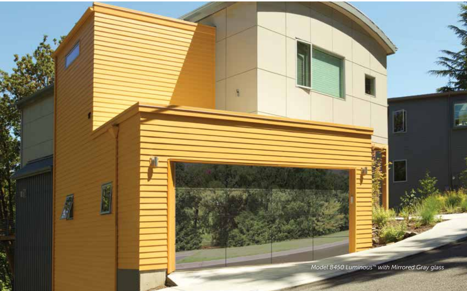
Model 8450 Luminous™ with Mirrored Gray glass