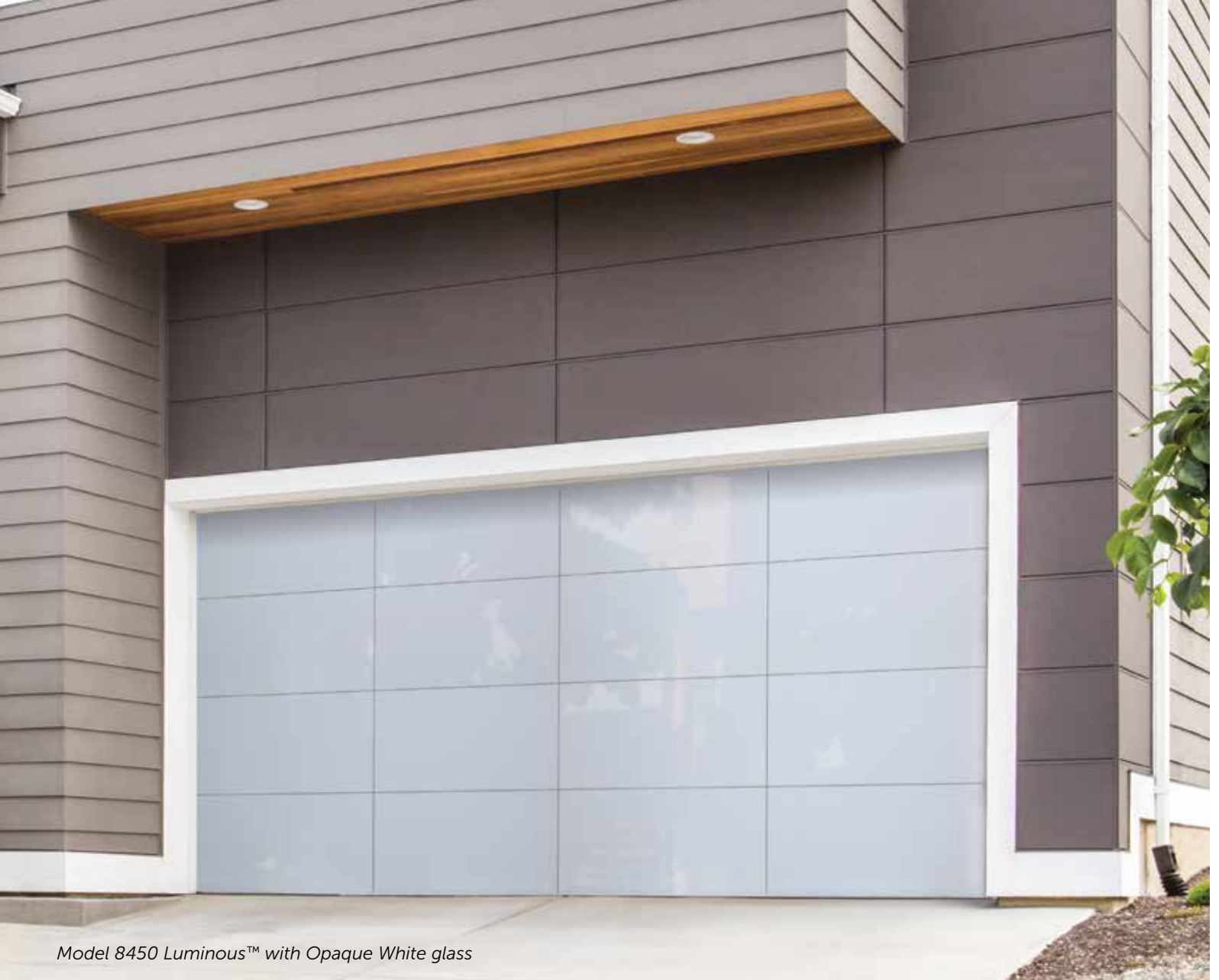
Model 8450 Luminous™ with Opaque White glass