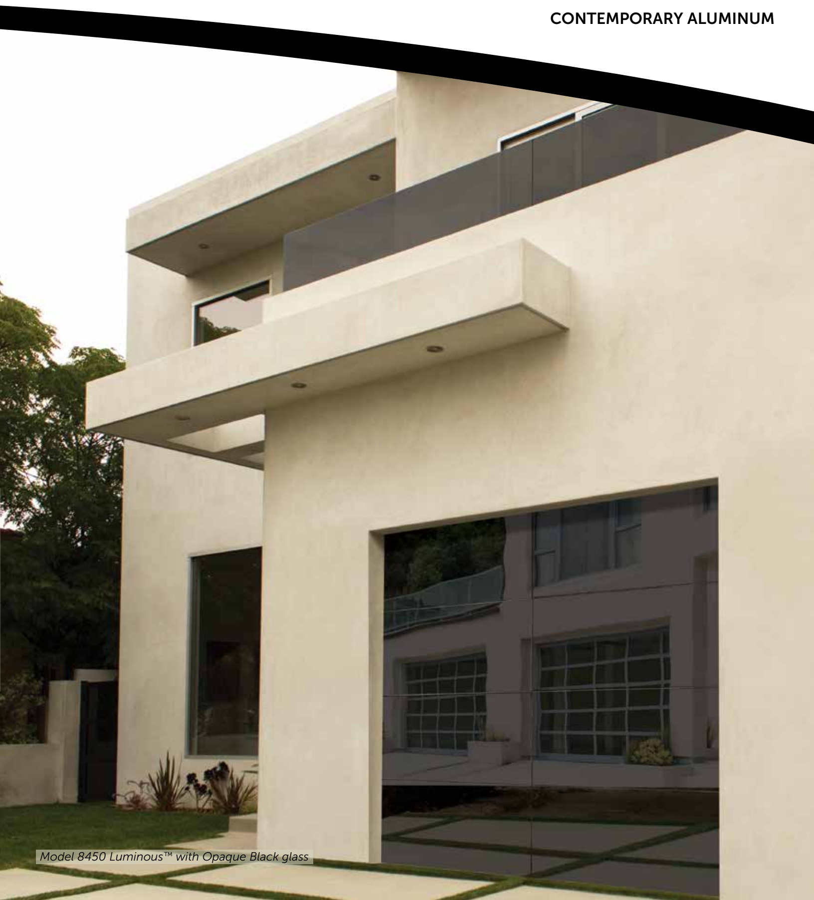
Model 8450 Luminous™ with Opaque Black glass