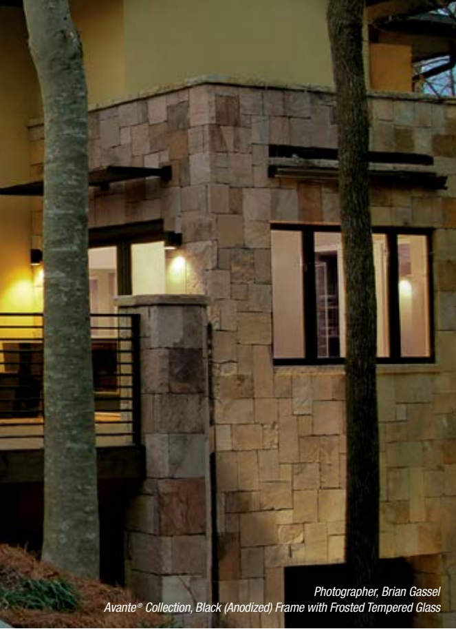
Avante® Collection, Black (Anodized) Frame with Frosted Tempered Glass