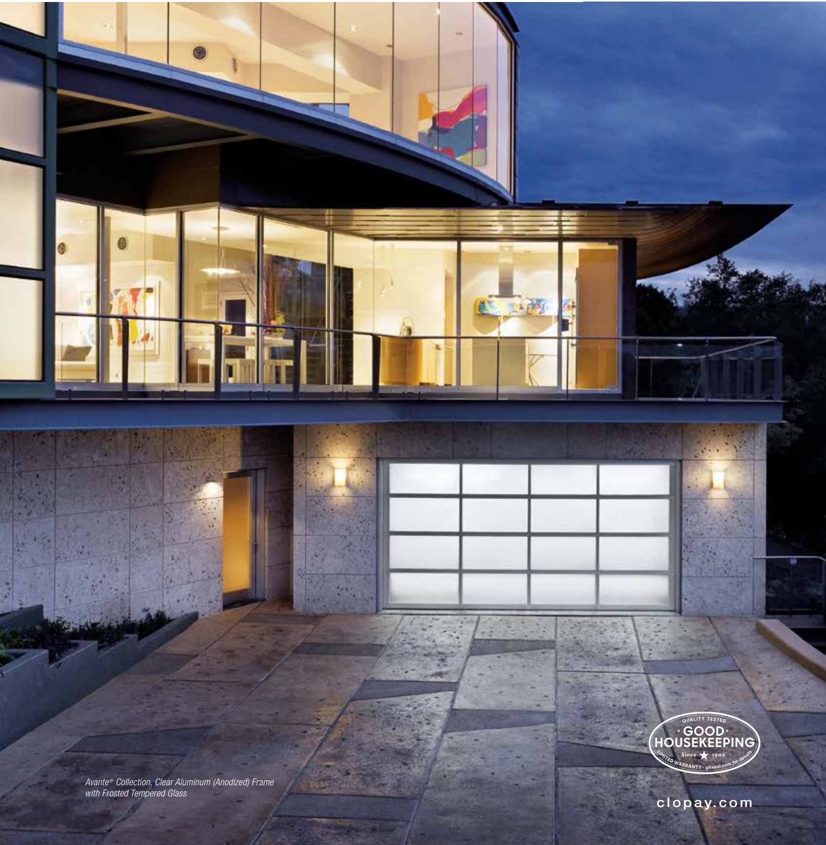
Avante® Collection, Clear Aluminum (Anodized) Frame with Frosted Tempered Glass