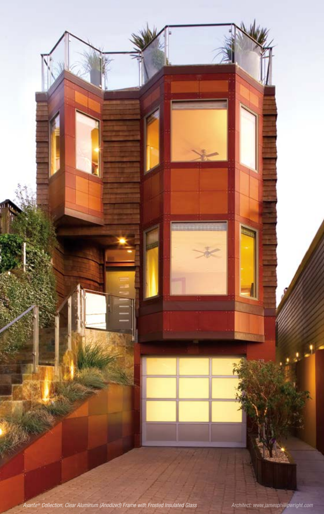
Avante® Collection, Clear Aluminum (Anodized) Frame with Frosted Insulated Glass